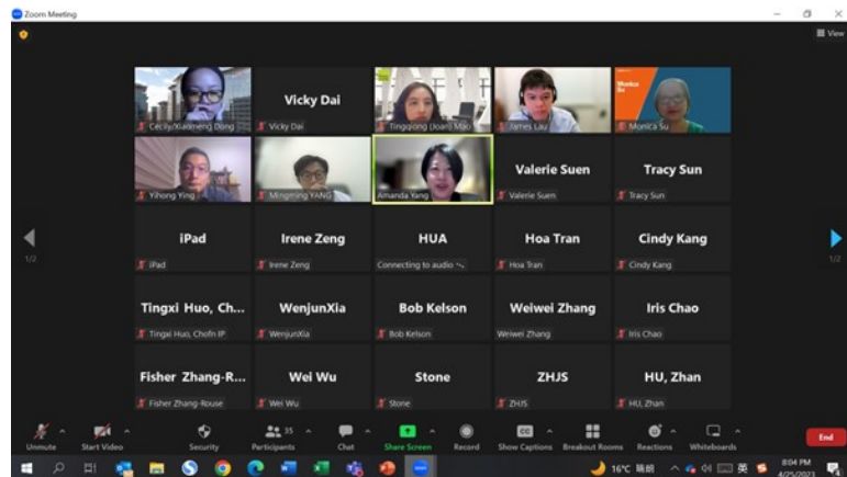
Participants of the roundtable