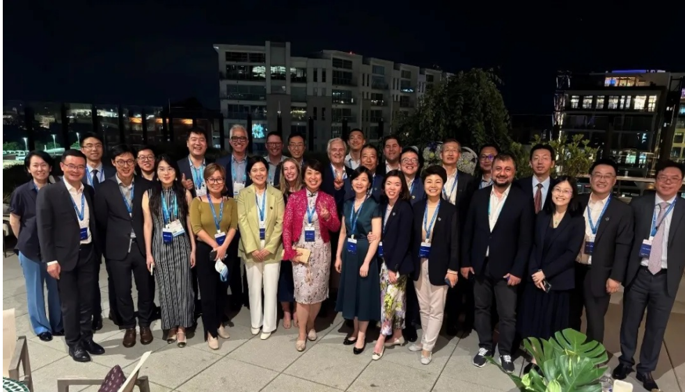
Wanhuda delegation and a few guests